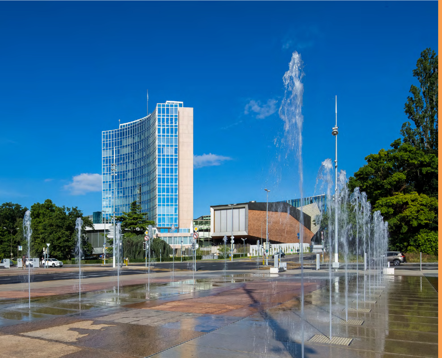
Headquarters building of the World Intellectual Property Organization (WIPO) in Geneva